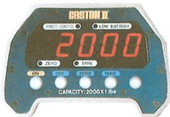
▲ Display & Keyboard