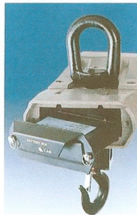
▶ Battery Pack Installation